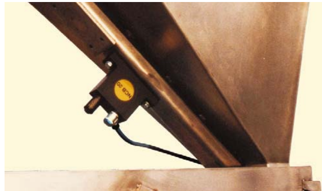
Emptying without bridging