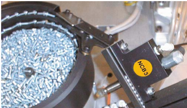
Sorting and aligning

*Dimensions for horizontal mounting, bore ØE